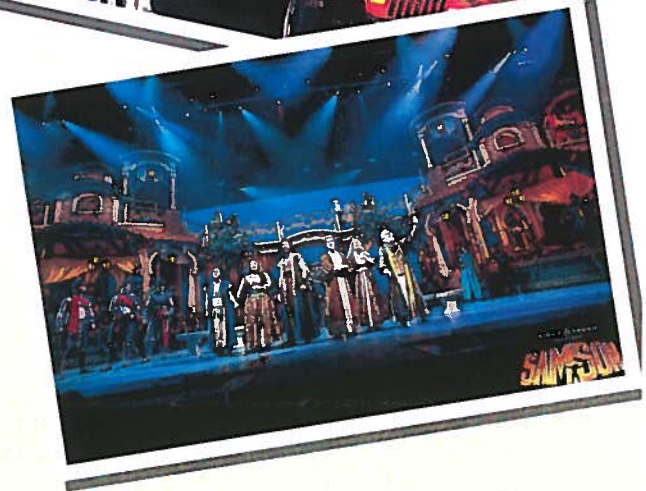
Itinerary Subject to Change without Notice

$990.00 Single Occupancy $840.00 Double Occupancy (per person) $795.00 Triple Occupancy (per person) $770.00 Quad Occupancy (per person)